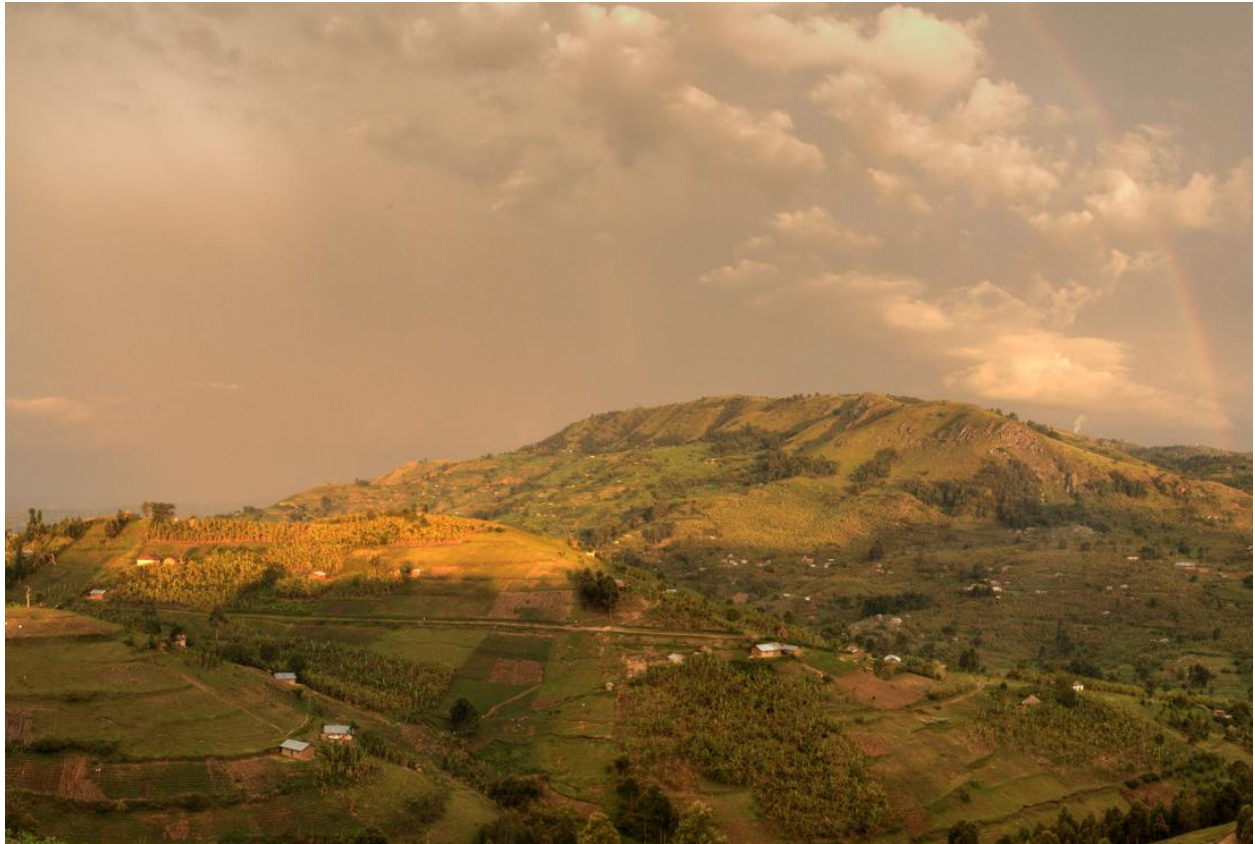
A sloping landscape in western Uganda.